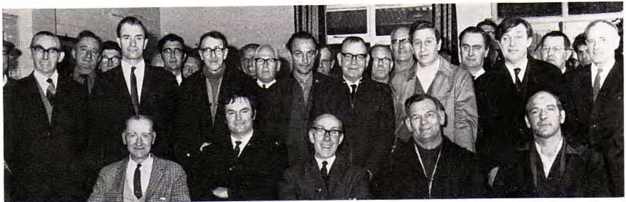
Some of the electrical fitters and substation attendants at their farewell ceremony at Marsh Lane.