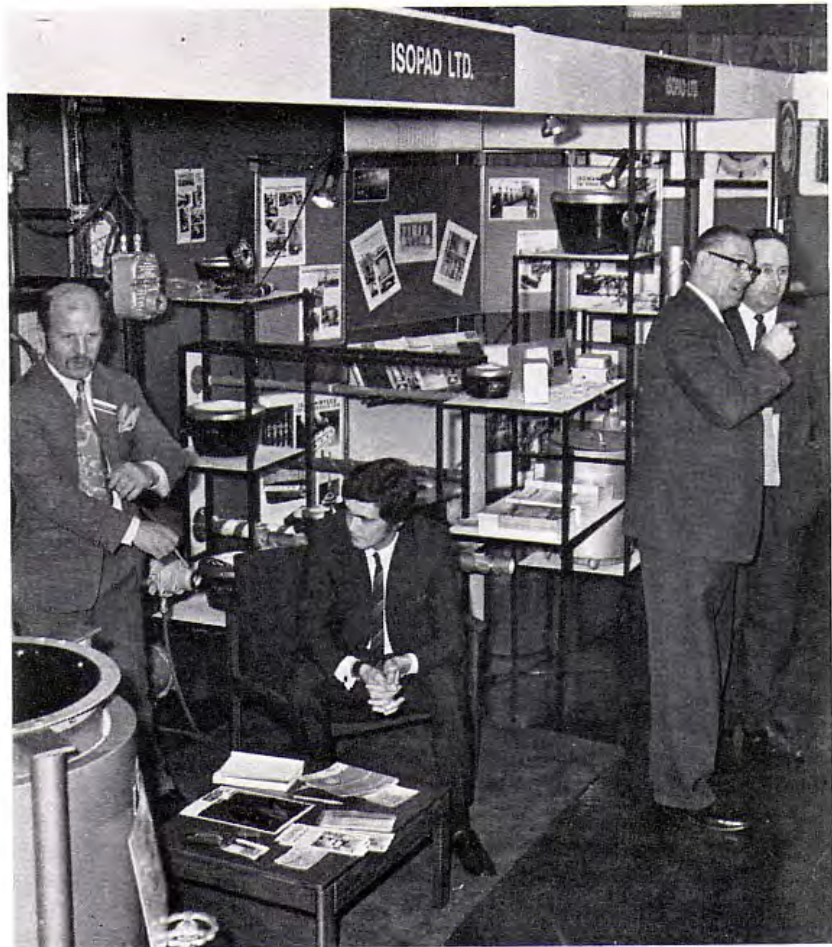
Above: MANWEB and manufacturers staff at the specialist exhibition in Liverpool.

The Course was organised by the District Joint Advisory Council.