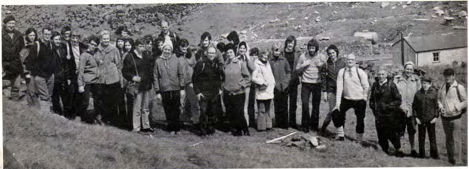
The MANWEB mountaineers pause for a picture on the way up Snowdon.