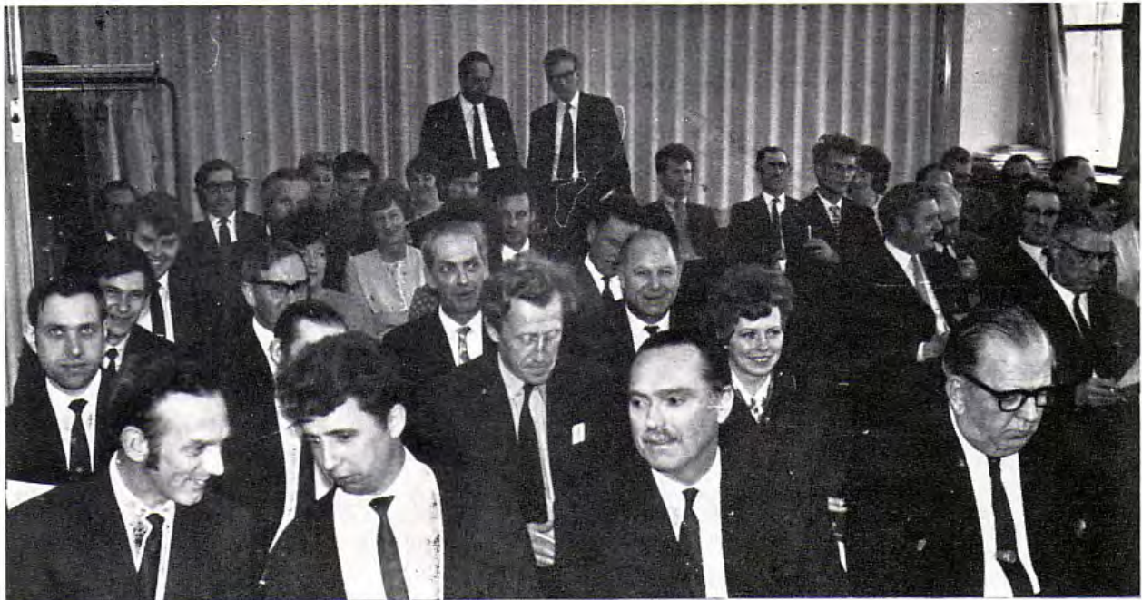
Below: Some of the delegates who attended the Induction Course for L.A.C. members.