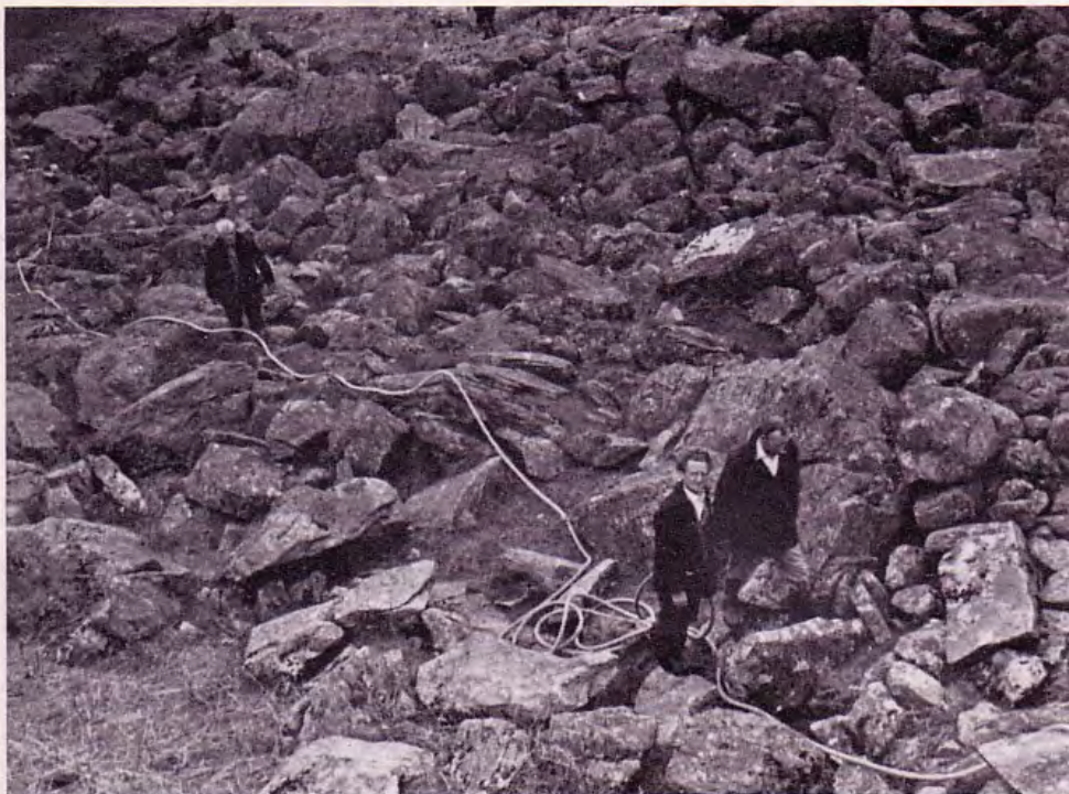
This picture shows clearly the difficult nature of the ground on which the line is being built, and explains why the raft idea was used to deliver the equipment!