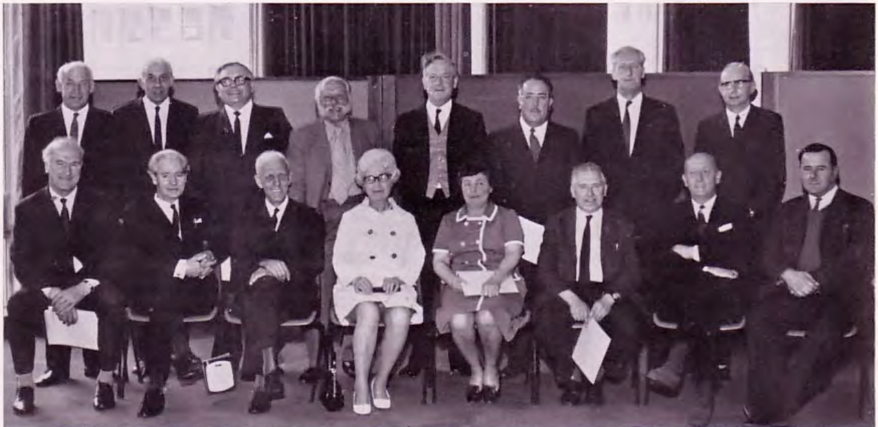
Some of the recipients of Long Service Awards for 35 Years (above), and for 25 Years (below).